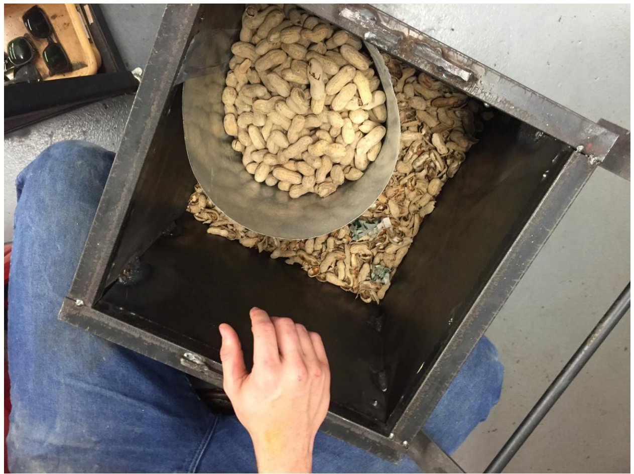
Design changes to the old prototype to make it a transportable peanut holder. It'll keep the Peanut and the shells separate.