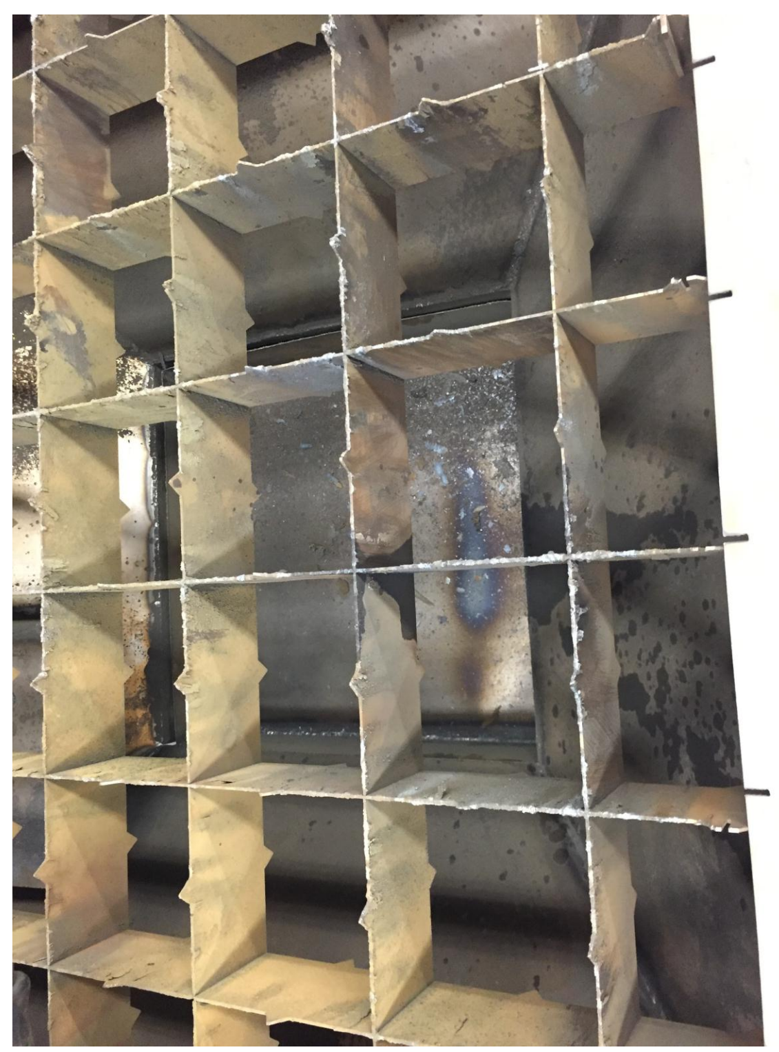
The freshly cleaned PlasmaCam ventilation system.