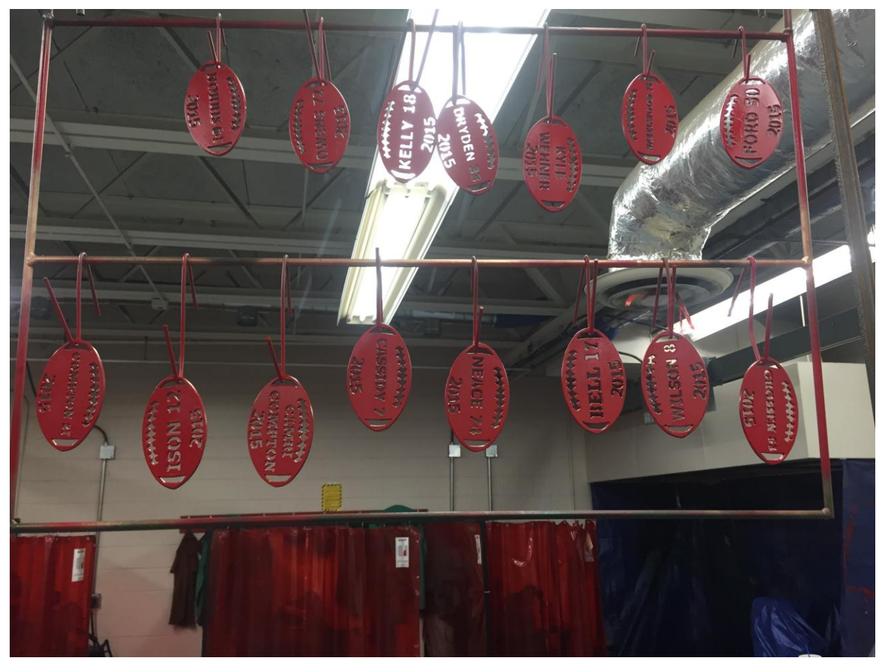
Football awards for the football team.