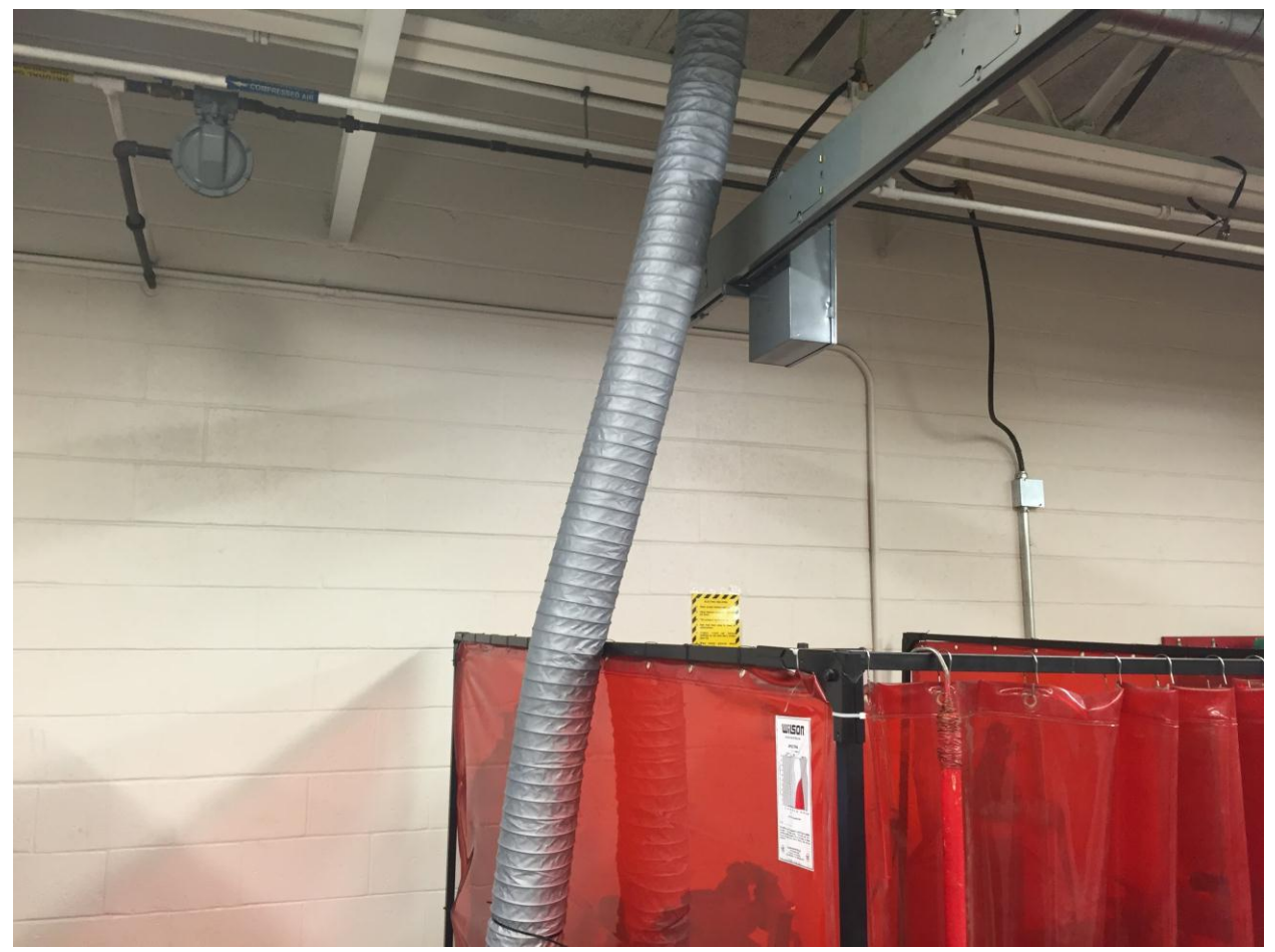
A vent tube that leads from our ventilation system to the PlasmaCam courtesy of Terry's Heating and Cooling .