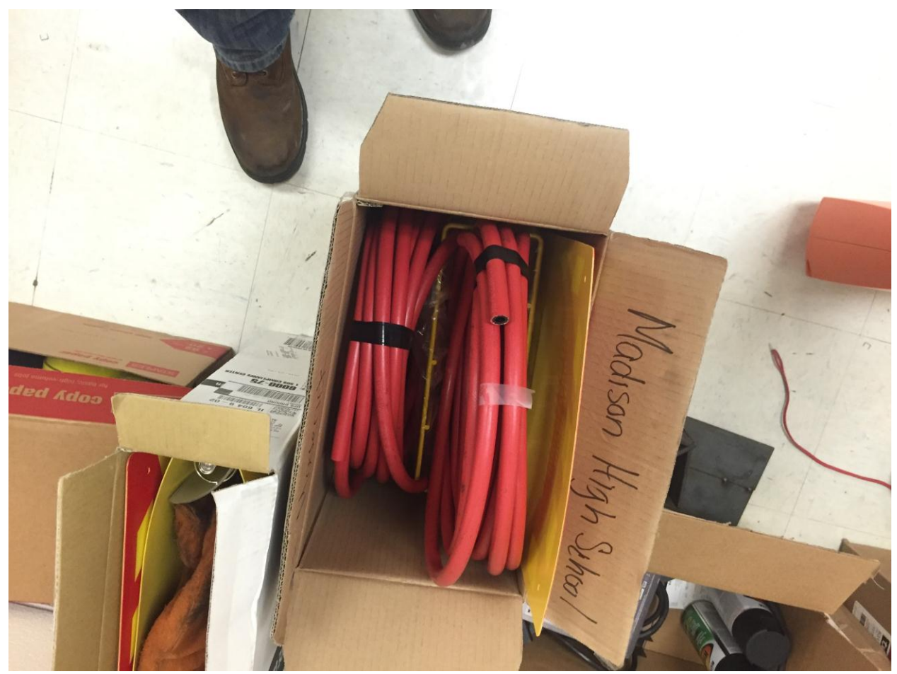
The donations from IKEC