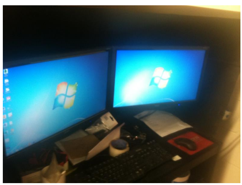
Our system for the Plasmacam but we are still testing everything out. But we are still in our testing phase.