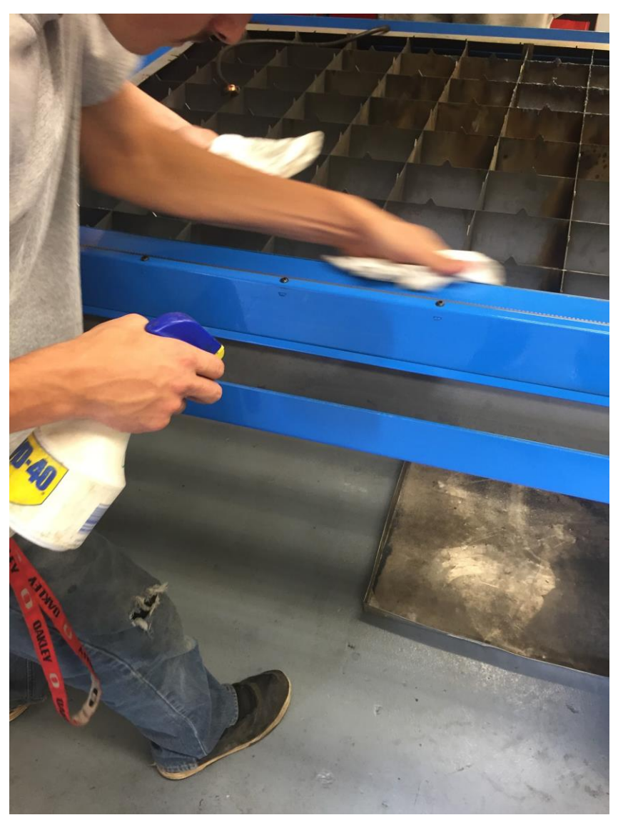
This is some of our Cub Manufacturers cleaning our new CNC Plasma cutter.

This week has been a busy week of getting everything organized and getting the brand new CNC Plasmacam. Also we set a ground rod to make sure our Plasmacam can function properly. We have to make a few minor adjustments to the Plasmacam so it makes more accurate cuts.